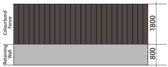
Boundary Retaining Wall