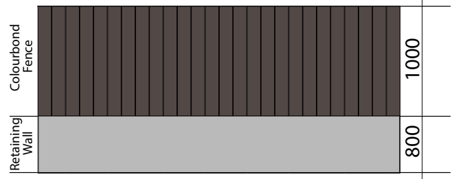
Boundary Retaining Wall

Minimum eaves overhang to pitched roofs of 450mm is required front and side.